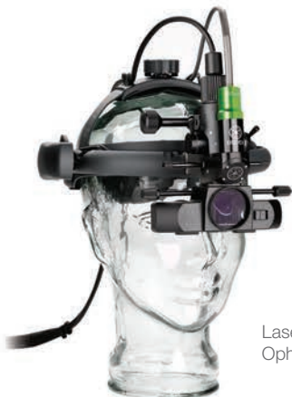
Laser Indirect Ophthalmoscope (LIO)