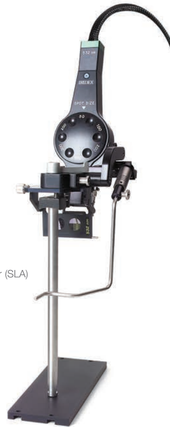
Slit Lamp Adapter (SLA)